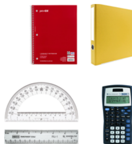
Figure 2: Also required — a notebook, a three ring binder for the handouts, a straightedge and a protractor, as well as a scientific calculator.